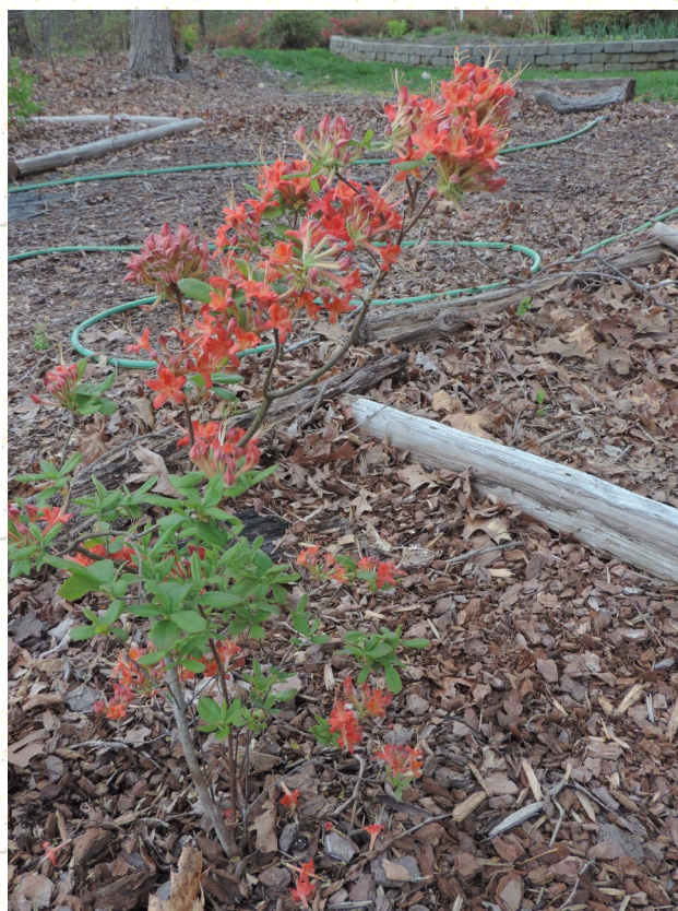
R. flammeum var. Jake's Red