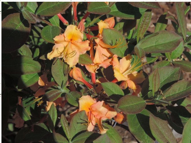
Hybrid Norma Strickland RST 18