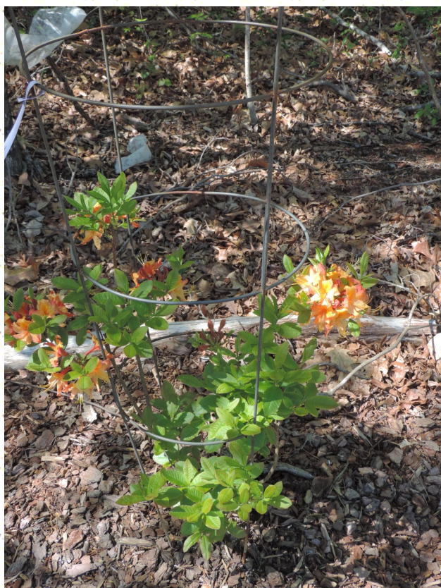
Hybrid Meredith Greene STR 20 30E