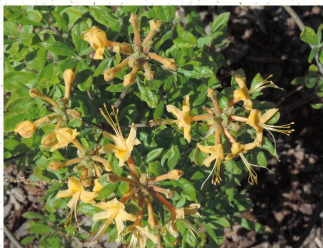
R. flammeum Oconee