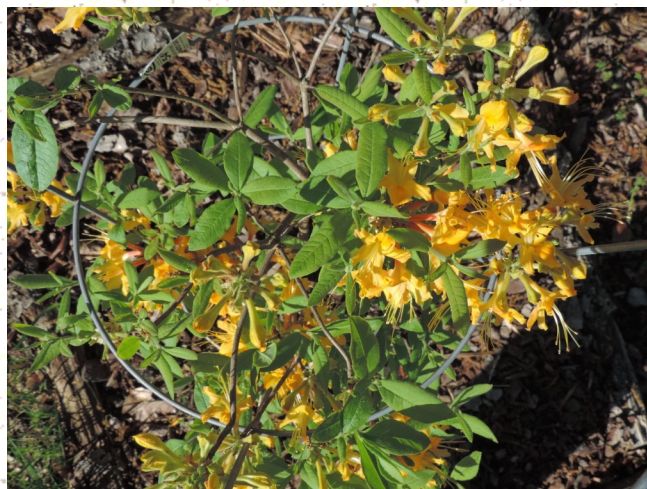
R. calendulaceum var. Earl's Gold