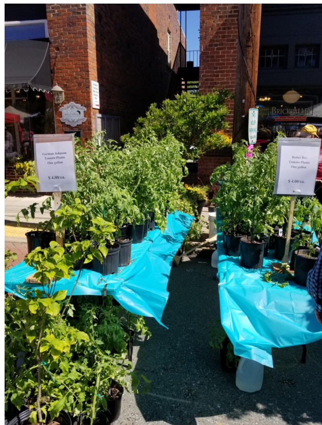
Upper Right— “Wanna buy a tomato?” Lower right—Fearless leader checks in on us.