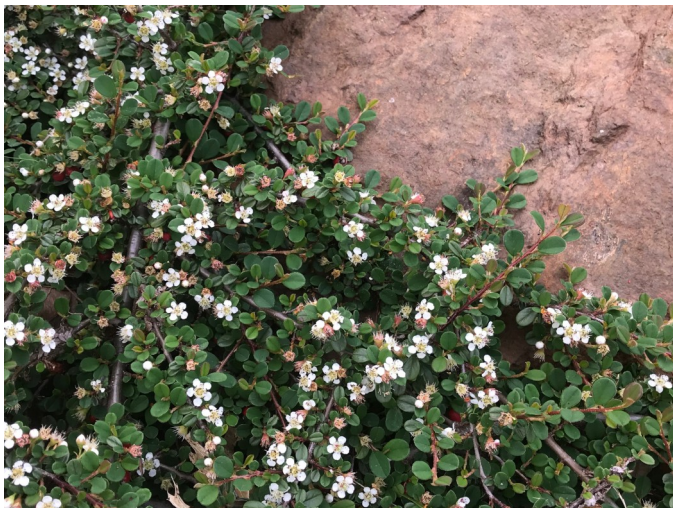
Cotoneaster ground cover