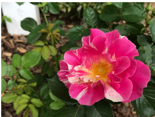
Peppermint Patty climbing rose