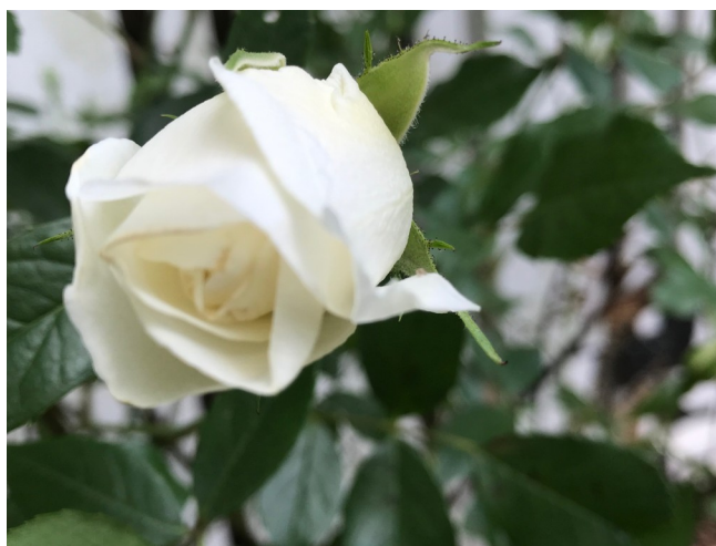
White climbing rose