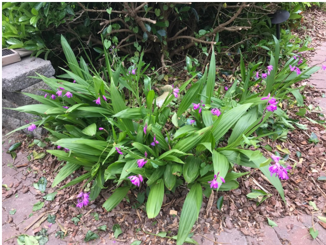
Vanillin terrestrial orchids