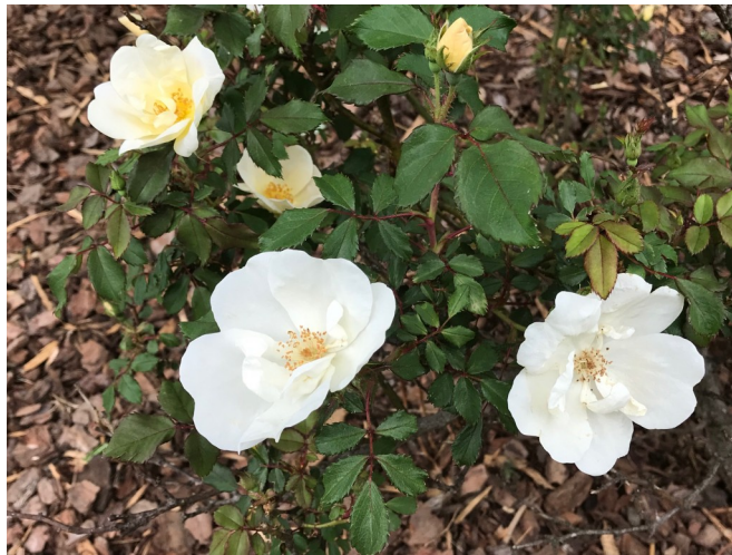
White knock-out roses