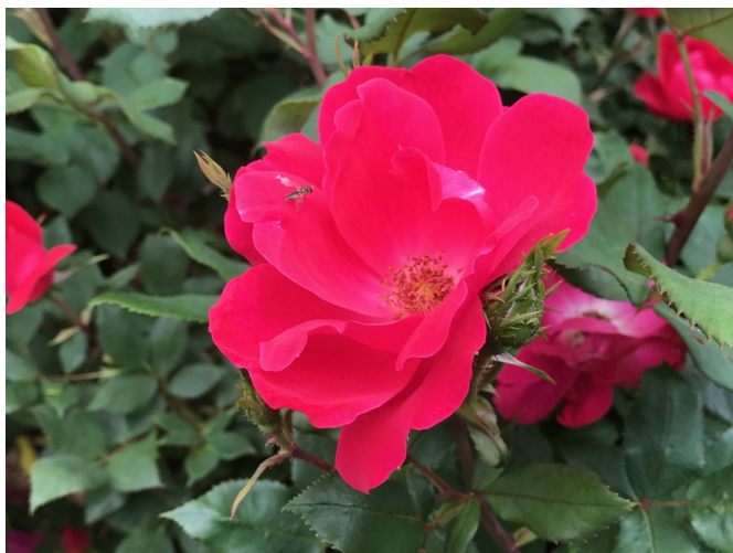
Red knock-out roses